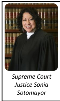
Supreme Court Justice Sonia Sotomayor

Your time in the LPPA will not be like anyone else's at McClatchy. Wade in and choose your niche or just start connecting and let the ideas—and opportunities—come to you.